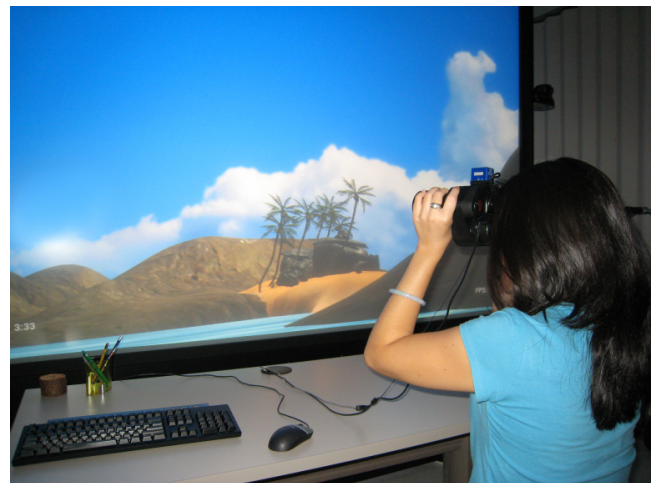
Figure 4: On a bird-watching mission, most subjects never turned the binoculars off for the whole duration of the trip.