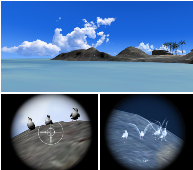
Figure 3: Top: approaching the Bird Island, panoramic view. Bottom: magnified view with a crosshair pointer for object selection (left); X-ray vision mode shows birds hidden behind the rock (right).