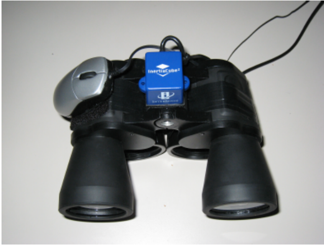
Figure 1: A pair of real binoculars with additional equipment for controlling virtual views. Mini-mouse buttons and wheel operate zoom, X-ray vision, snapshot mode, and 'reality freezer'. Intersense InertiaCube 2 tracker is attached to the top. At the bottom, an additional pair of viewing tubes can be seen.

By adding a wheel control and a few extra buttons, the baseline model of virtual binoculars can be significantly enhanced, as described in the next section.